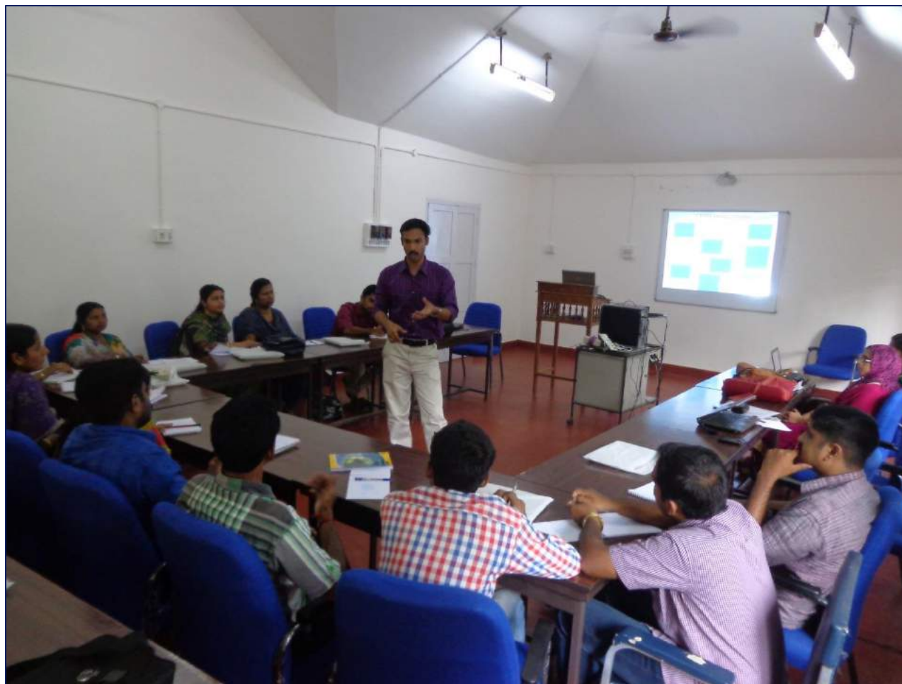
Orientation of Supervisors on PTP under NDP I